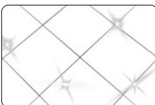
No rinsing required. Rinse free & streak free!