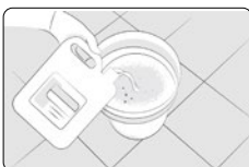
Dilute depending on cleaning requirements