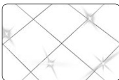
No rinsing required. Rinse free & streak free!